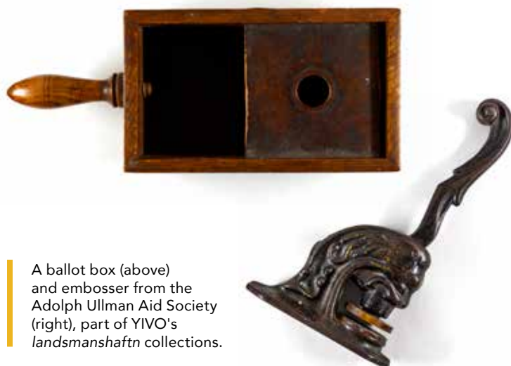
A ballot box (above) and embosser from the Adolph Ullman Aid Society (right), part of YIVO's landsmanshaftn collections.

Landsmanshaftn collections contain a wealth of information. While it varies collection to collection (we have papers from about 1,400 individual organizations), many contain cemetery maps, financial records, meeting minutes, membership ledgers, photographs, and other ephemera. For individual researchers, these are rich genealogical resources. And taken as a whole, they are key historical records of Jewish immigrant life around the world.